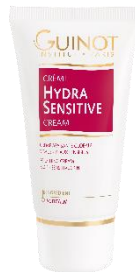
HYDRA SENSITIVE CREAM SOOTHING CREAM