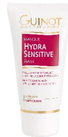
HYDRA SENSITIVE MASK INSTANT SOOTHING MASK